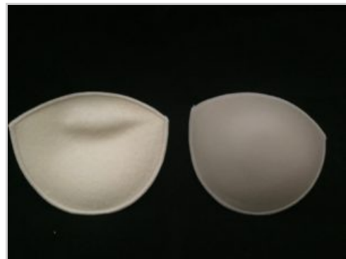
front side left, back side right

You can not see Milkies Breast Pad Ever through my shirt but I definitely can tell when I am wearing them! You can not visibly see Milkies Breast Pad Ever but I can tell my breasts look a little more uplifted.