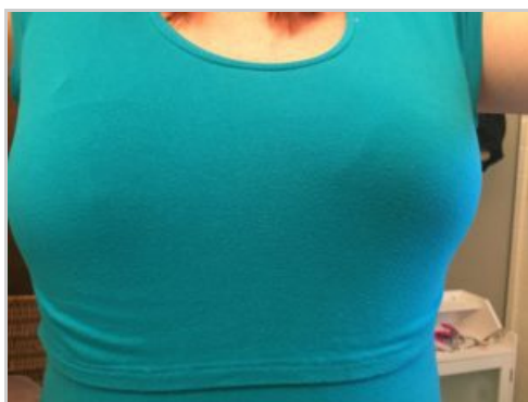
left without, right with Milkies Breast Pad Ever

You can not see Milkies Breast Pad Ever through my shirt but I definitely can tell when I am wearing them! You can not visibly see Milkies Breast Pad Ever but I can tell my breasts look a little more uplifted.