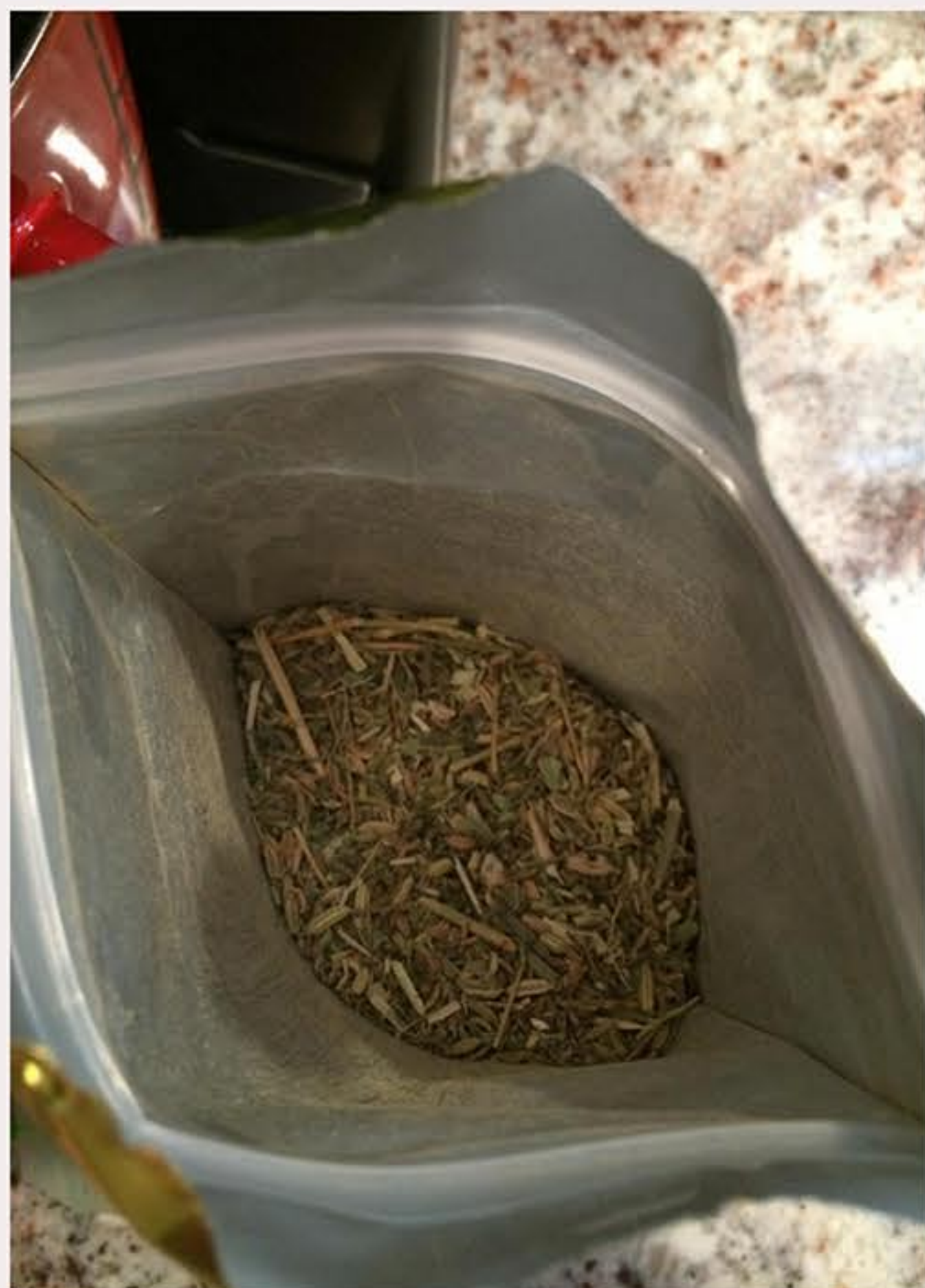
Take a look inside the bag of Nursing Time Tea from Fairhaven Health!

When it comes to the flavor of the tea it is very difficult for me to explain. It is a very light flavor. Not really a lemon flavor like it says, there is a tiny hint of lemon but also a hint of licorice as well. Not so much that it is nasty or overwhelming though. Honestly it mostly just tastes like a mix of herbs. Again it is a very light flavor which I like more instead of a strong overwhelming flavor.