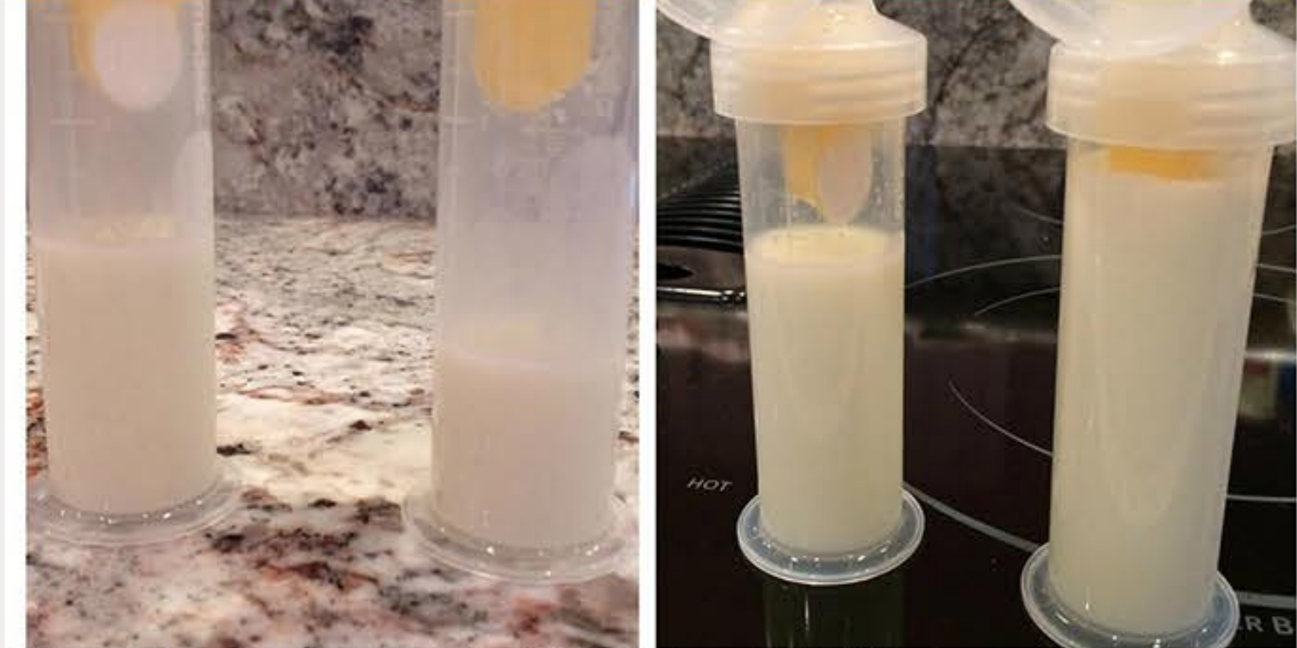
Left is a pump after nursing without the tea and the right is a pump after nursing after drinking the tea!!