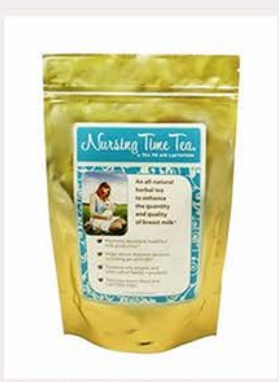
Fairhaven Health's Nursing Time Tea!